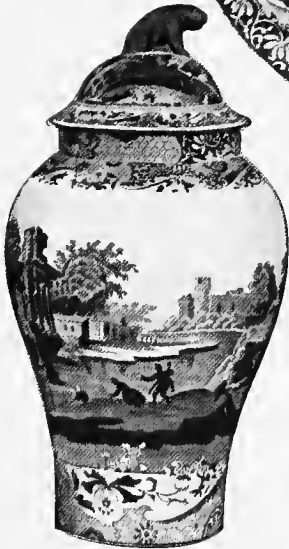
ITALIAN Blue Printed Ware produced by Spode in 1775, illustrating Roman ruins, and executed by celebrated engravers.